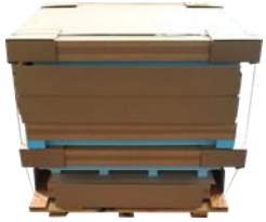
Quarter HPPS External dimensions when flat-packed: 1535 x 1275 x 1030 mm